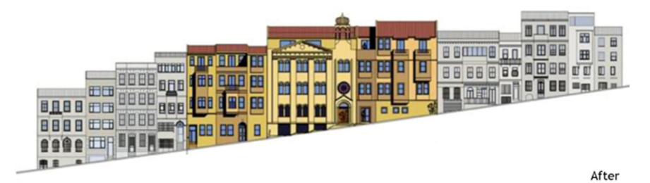
Figure 3: Tarlabaşı project drawings.