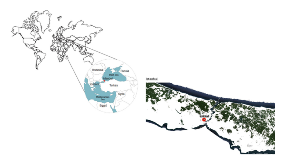
Figure 2: Istanbul and Tarlabaşı's location map.

class residential area. Tarlabaşı was a place of non-Muslim people including Jews, Armenians and Greeks excluded from the Holy City or historic area [9]. During World War I the Ottoman Empire allied itself with Germany and the Austro-Hungarian Empire and following its defeat the Ottoman Empire ceased to exist. In 1923 the new Republic of Turkey was created in the Anatolian heartland of the Turkish people but the cosmopolitan city of Istanbul fell from favour as Kemalist nationalism emphasized the new Republican capitol of Ankara.