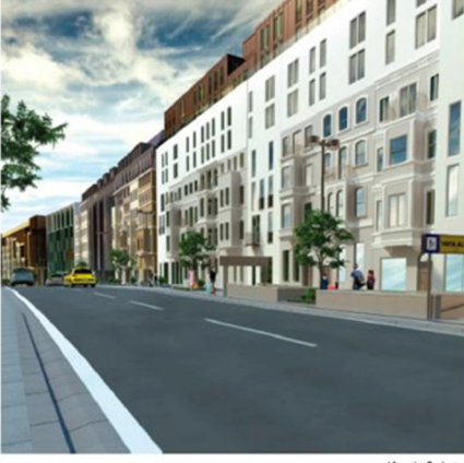
Figure 5: Tarlabaşı project drawings.

This renovation project specifically focused on protecting the historical identity of the buildings.