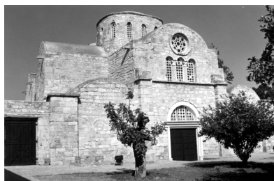
Figure 2: The five-domed church of St. Barnabas.

As a whole, Byzantine Period is considered to be very prolific, its art reflecting the prosperity of the age. However, not much remain of the works were carried out at that time [4]. One of the major works of the period is St. Barnabas Church and Monastery (early of the tenth century) that has still been maintained in good condition (Fig.2). Today, it is used as an icon and archaeological museum and consists of two parts. The first is the main five-domed church building inside of which wall paintings, various icons and other items are being displayed. The other part opens to a courtyard through an arcade system. Different archaeological creations inherited from various periods are exhibited therein.