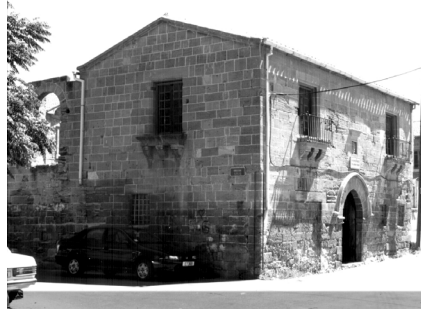
Figure 4: Lapidary Museum in Nicosia.

also constructed the walls that are still standing around Nicosia. Most of the architectural buildings of that time are of military nature. However, there are also a few examples that have different functions such as; Queen's House, Bidulb Gate and some dwellings [5]. A dwelling unit inherited from the Venetian Period has been preserved through adaptive re-use. Today, it is used in Nicosia as a lapidary museum (Fig.4). The main entrance of the building, its windows, building materials and construction techniques, give some clues about its stylistic character.