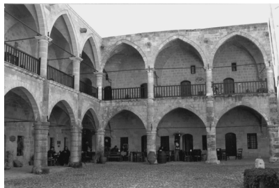
Figure 5: The Great Inn (Buyuk Han) in Nicosia.

During this period, Cyprus lost its links with Europe by being incorporated into the rule of the Ottoman State. As a result of this change, numerous important “waqfs” (foundations) were established and for over four hundred years they gave support to the building activity in the island.