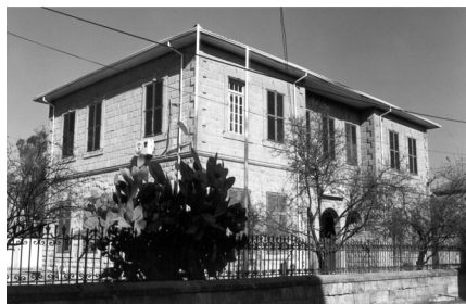
Figure 6: The Department of Ancient Monuments and Museums in Nicosia.

After nearly four hundred years of the Ottoman sovereignty, British was another effectual civilization period onto Cyprus. British Empire would be a pioneer that began to apply new materials and techniques to Cyprus architecture. Also, they brought a new culture, rules and regulations to the island, which became effective on the shaping of its architecture. In the eighteenth and nineteenth centuries there was a revival of the architectural style of ancient Greece and Rome. This, Neo-Classical style was used in public buildings and domestic architecture. Doorways had flat stone imitations of Roman columns and these were called pilasters. Above the door, a balcony of decorative ironwork was supported by ornamental brackets. This style was placed at the Victorian period of British. Therefore, it reached the island in 1878, via British Society [6].