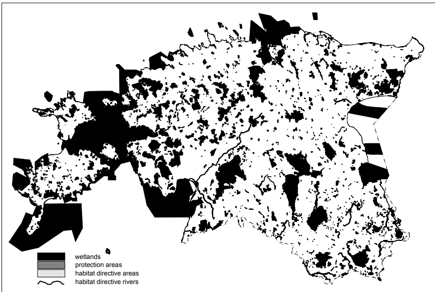
Figure 2: Nature protection areas, proposed EU Habitat Directive areas (Natura 2000 sites; as of 2004) and wetlands in Estonia.

In 1997, a specified wetland inventory was carried out, and as a result, it was recommended that large amount of wetlands (99 mires, 6 floodplain grasslands and 21 coastal grasslands) be taken under conservation.