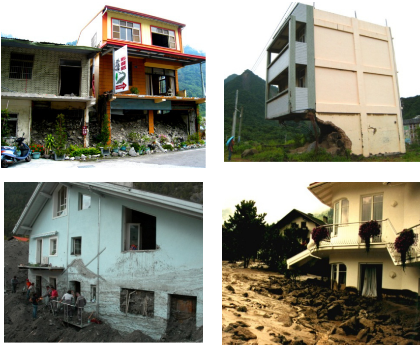
Figure 3: Typical damage patterns for buildings affected by torrent processes in Taiwan (top) and Austria (bottom). Upper left: Songhe community, Taiwan, August 2004, upper right: Min-Zu community, Taiwan, August 2009, lower left: Pfunds community, Austria, August 2005, lower right: Wartschensiedlung village, August 1997.

concrete (16 out of 39 buildings studied), often due to the earthquake-resistance building codes, the typical alpine building style is dominated by brick masonry and concrete base-plates. As a result, given the same impact pressure the buildings in Austria would collapse while the buildings in Taiwan would still resist even if an economic total loss is evident, as shown in Fig. 3, upper right. In Taiwan buildings are regularly heavily damaged (damage ratio > 50 %, 25 out of 39 buildings), while in Austria only few buildings are a total loss [9]. These differences are again a result of different impact towards exposed elements at risk, resulting from different process characteristics.