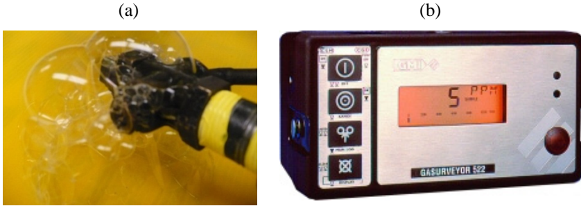
Figure 1: (a) Soap screening technique, (b) GMI Gasurveyor 500 Series.

on and the location of bubbling indicates leakage [8]. The Gasurveyor™ 500 Series (fig. 1(b)) made by GMIL, United Kingdom is a highly flexible, electronic portable gas detector designed as per latest standards and is certified for use in hazardous areas. The detector has liquid-crystal display (LCD) screen with automatic backlighting, audio, visual and fault alarms and are one of the state-of-the-art gas detectors.