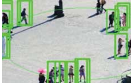
Figure 2: Image Processing Module Output without clustering.

associated to the normalized histograms taken as descriptors. In Fig. 2 an example of image processing module output without clustering is shown.