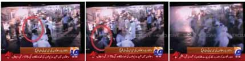
Figure 5: Kamikaze in action into red ellipse.

This is because, regardless what the NARX network reports, the feed forward network acts like a threshold and reports that many people are running much faster than a walking speed mean.