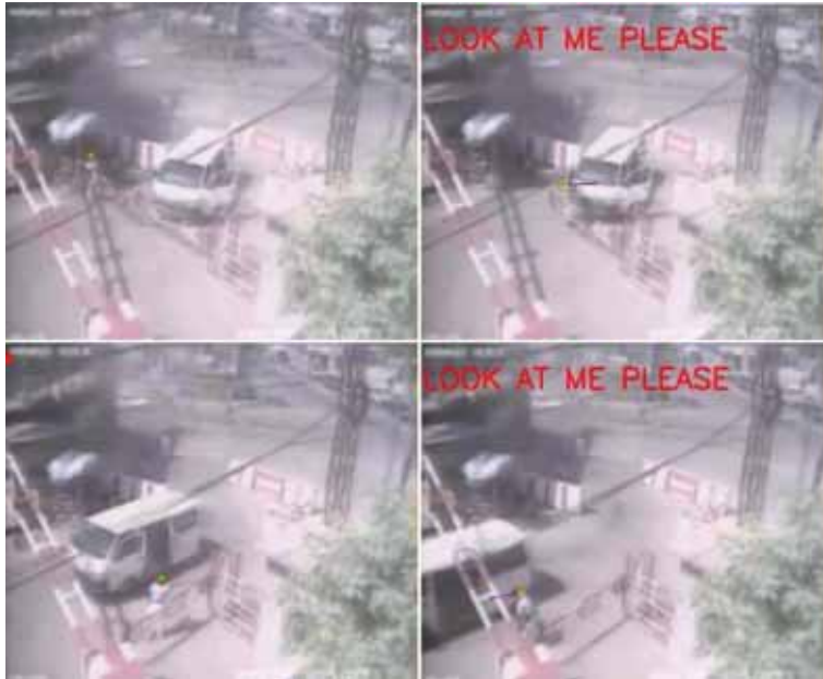
Figure 8: Attackers brake down entrance defenses going faster back and ahead continually trying to open the gate. In this case a proper message (Look at me please) is shown for a few seconds on the monitor to alert the operator.

With these ‘checks’ APART can understand if someone is spying the entrance (he changes own direction many times), if someone is escaping (one person changes his direction and runs away), etc.