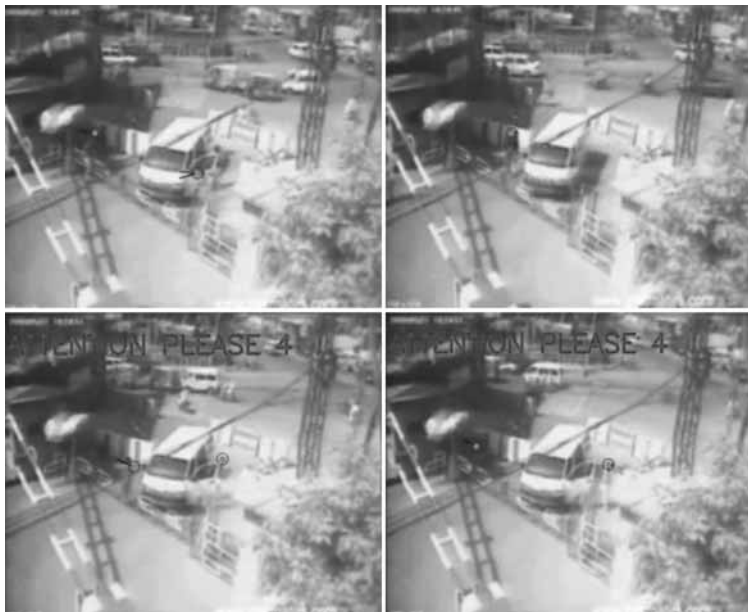
Figure 7: A guardian goes to inspect a van. Then an attacker goes out faster from the van meanwhile the guardian comes back running. In this case a proper message (Attention please) is shown for a few seconds on the monitor to alert the operator.

In the second scenario, instead, an attack to a police station by two gunmen with a white explosive van is present (Fig. 7). Here are considered situations like