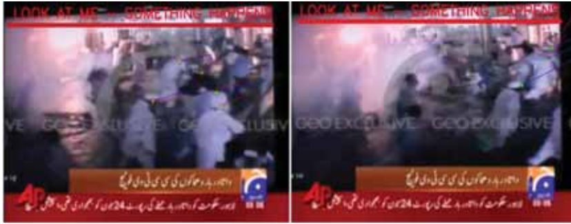
Figure 6: Explosion, panic, many people running away and APART in action. In this case a proper message (Look at me – Something happens) appears on the monitor to alert the operator.