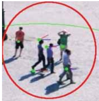
Figure 3: Pedestrian state prediction module output where the darker vector is the measured speed and the whiter vector is the predicted one.

Finally, once optimized, this block sends a predicted speed vector, for each pedestrian in the scene, as input to the last module.