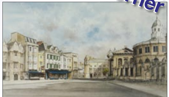
Watercolour of Broad Street, Oxford by Ken Messer painted in celebration of Blackwell's 125th anniversary in January 2004. It shows Blackwell's original bookshop with blue shop canopies.