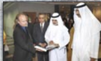
Author's Corner: Book Launch in the Middle East