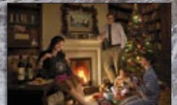
Our 1950s Christmas card with a twist!