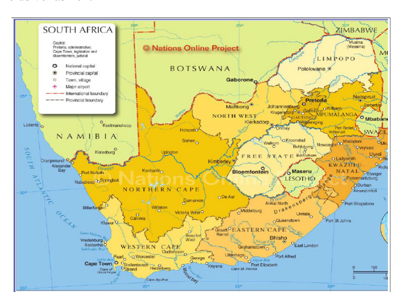
Figure 1: Provincial Systems Spatial within South Africa.

This division of the spatial systems was derived at through a scientific demarcation process and considerations by the Demarcation Board in 1998. The basis of demarcation is to arrive at an ideal structure of local government that are spatially integrated, institutionally sound, functional viable and developmental in orientation [17]. If the data and information and demarcation process followed is assessed, it is clear that this is more of an administrative process as the content of regional planning theory, spatial system realities and potential is not addressed in an inclusive fashion.