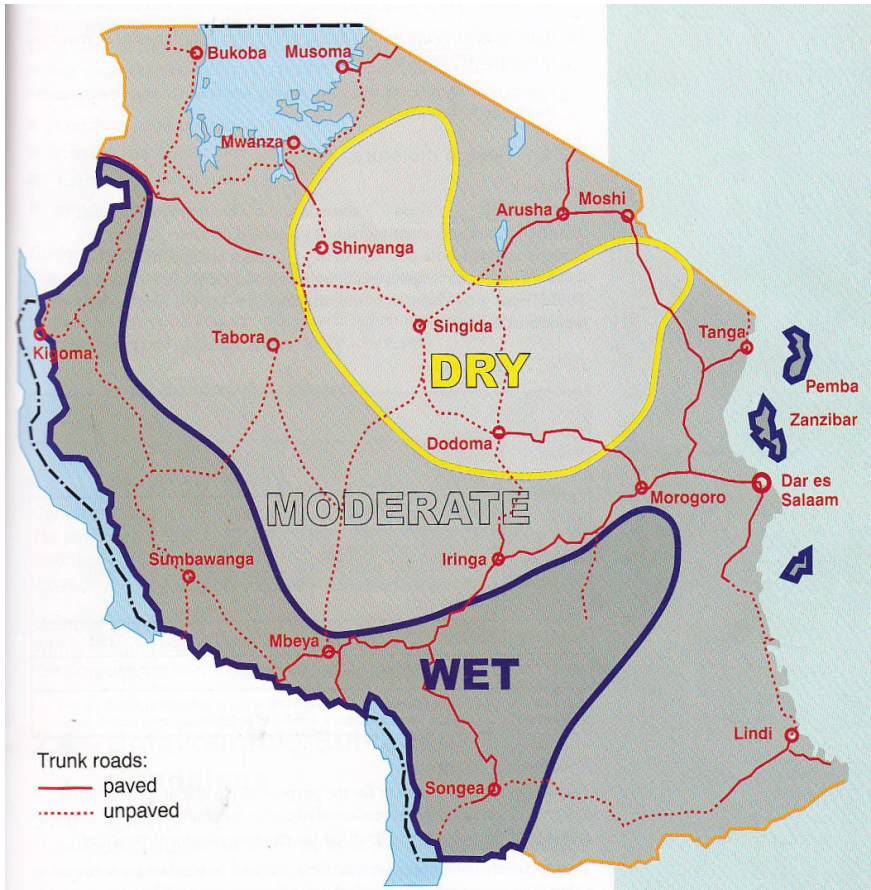
Figure 1: Climatic zones.

In gravel roads design, the construction and maintenance of these capacities can be translated into the increasing capacity of the individual pavement engineer to monitor the performance of gravel roads and understand its interaction with traffic, environment and climatic changes.