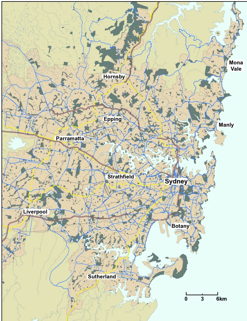
Figure 1: Map of the Sydney metropolitan region and surrounds.

behaviour, transport planners need to develop transport strategies and policies aimed influencing traveller behaviour. This requires testing the effects of such strategies in a modelling environment, requiring a trip-timing model framework within which peak spreading parameters can be introduced and tested.