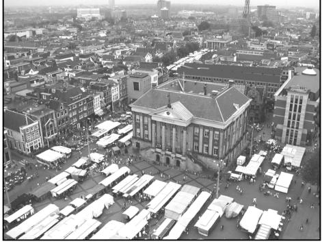
Figure 3: Grote Markt (in front) and Vismarkt (behind) of 1973 (left photo) and today (right photo).

Opposing opinions could also be heard at the end of 1974. They were perhaps stimulated by the fact that the shops along the Vismarkt, which was just made car-free, particularly along the closed southern road, suffered from a serious