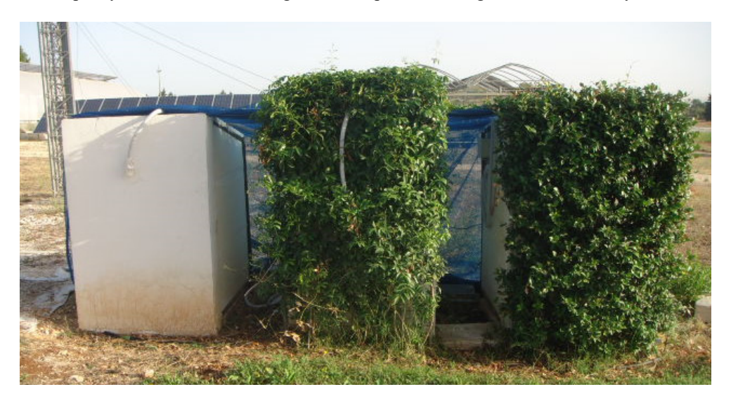
Figure 1: The three walls at the experimental field of the University of Bari: the uncovered control (the left wall), the Pandorea jasminoides variegated green façade (on the central wall), the Rhyncospermum jasminoides green façade (on the right wall).

A typical Mediterranean building solution was followed for the setup of three experimental walls in open environment, built facing south. The walls are made of perforated bricks, arranged in a single skin, joined with mortar (Fig. 1) with a width of 1.00 m, a height of 1.55 m, and a total thickness of 0.22 m, including 0.02 m of the plaster coating. The masonry is characterized by a thermal conductivity coefficient of 0.28 Wm<sup>-1</sup>K<sup>-1</sup> [27] and a heat capacity coefficient of 840 Jkg<sup>-1</sup>K<sup>-1</sup>. The plaster coating is characterized by a thermal