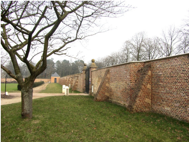
Figure 3: Enclosure of the Abbey of Tongerlo, southern part.

In an initial step, the proposed scheme will be confronted with the restoration of the fifteenth century enclosure of the Abbey of Tongerlo (fig. 3), including the repair of the roofing and the wooden roof structures of three small buildings that are part of the enclosure. The project represents interventions on historic building materials (masonry repair), interventions of historic structures (timber roof structures) and interventions on the functional building requirements (drainage system). It is therefore a good case to assess the gap between the quality management approach and practice, to understand possible obstacles for the implementation of such an approach and finally to understand if the quality management approach could be a starting point for measuring the durability of a specific intervention.