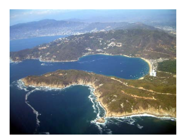
Figure 2: Map of the Bay of Puerto Marqués.

tourist integration zone known as the Diamond Zone, in order to comply with the objectives foreseen in the Law of Tourist Promotion with an area of 240,661.12 m<sup>2</sup>" for 8 September 1992, 41,240 m<sup>2</sup> were expropriated with the same purpose.