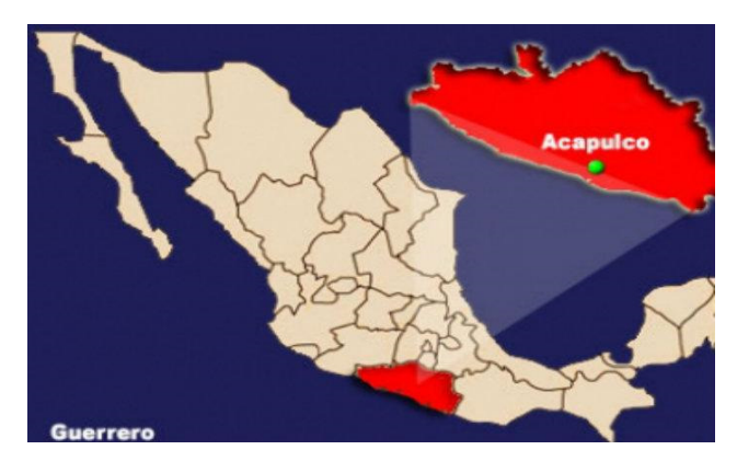
Figure 1: Map of Mexico.

The objective of the research is to determine the effects on the environment and natural resources of the Bay of Puerto Marqués in Acapulco and the civil resistance that its inhabitants have presented to the government of the State of Guerrero. This is motivated by the tourism boom that has generated favorable conditions of public policies to expropriate the land to peasants exposed to the power of the hegemonic state, through successive expropriation decrees the first on 12 June 1992 "it is declared of public utility and the expropriation is decreed in favor of the decentralized organism of the government of the State of Guerrero, Promotora Turística de Guerrero, the land without construction, located in the