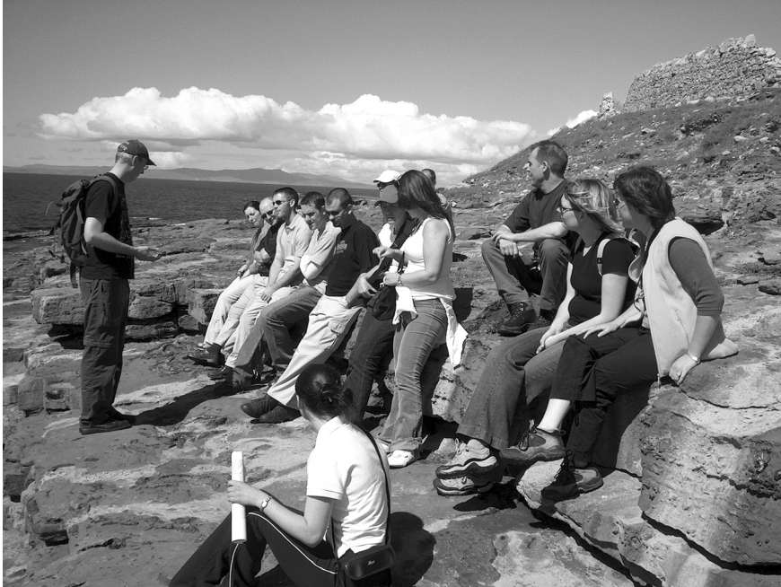
Figure 4: The project team on a field visit to the region.

Survey of Ireland, the Geological Survey of Northern Ireland and the University of Ulster (Academy of Irish Cultural Heritages). A second tranche of funding was secured from SEUPB in 2007. The partners formed the Breifne Mountains Co. Ltd. with each organisation appointing Directors to the Board. Other Directors represent Fáilte Ireland and County tourism officers.