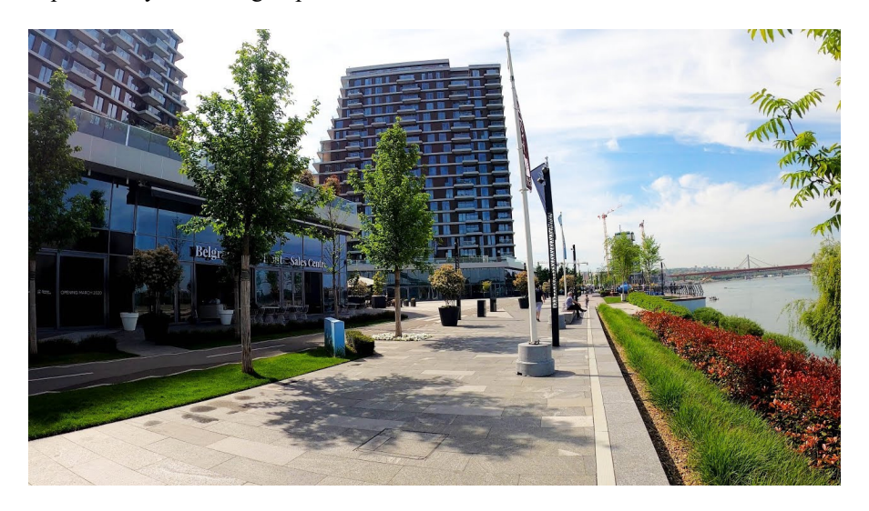
Figure 3: Promenade.

In the general division of land use, public land is presented as a 70% share and other (residential and commercial) uses as 30%. However, the border of the plan includes the water surface of the River Sava, greenery and planned streets on the opposite bank (Fig. 2). This means that percentage of public land in the planned development is not exactly as calculated, but much smaller. Besides the already-built residential blocks and shopping mall, with a skyscraper under construction, the only public use is the pedestrian promenade by the river with several playgrounds (Fig. 3). The position and urban design were not debatable, but it soon became a new gathering place for citizens, although the promenade is on a higher level above the river bank, in order to protect it from flooding. But other issues like the position, shape and height of the buildings and the blocked views of the city and its skyline, and the proposal to remove the old tram bridge across the Sava and build a new one, have once again raised protests by citizens' groups.