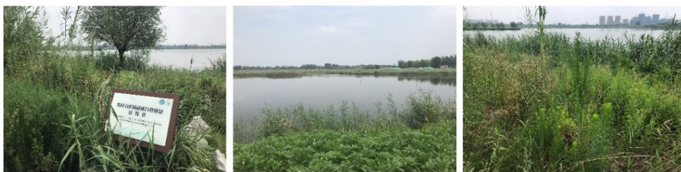
Figure 1: North Lake Marsh Wetland in Xuzhou.

One abandoned site – North Lake Marsh Wetland – in Jiulihu district is an experimental area of natural restoration in abandoned coal gangue field in Xuzhou (Fig. 1). The area is restoring itself by the power of nature after subsiding steadily along with the overgrowth of spontaneous vegetation and biodiversity [74]. According to our field trip, it is a home for a wide range of birds. Most bird species are listed in the national document List of Terrestrial Wildlife that are Beneficial to the State or have Important Economic and Scientific Value , published by the State Forestry Administration. One species – Anser cygnoides – is included in the IUCN Red List of Threatened Species 2016, and being assessed as vulnerable [78]. Interestingly, Yang's study [74] found that the public in Xuzhou deemed North Lake Marsh Wetland had higher ecological value compared with an artificial wetland park nearby. However, people's overall evaluation of artificial wetland park is better than North Lake Marsh Wetland.