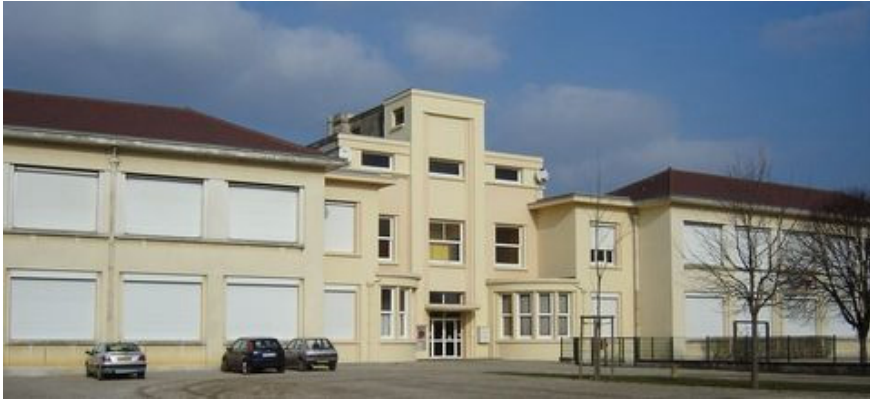
Figure 2: Pasteur School.