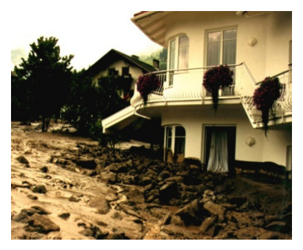
Figure 3: Typical damage patterns for buildings affected by torrent processes in Taiwan (top) and Austria (bottom). Upper left: Songhe community, Taiwan, August 2004, upper right: Min-Zu community, Taiwan, August 2009, lower left: Pfunds community, Austria, August 2005, lower right: Wartschensiedlung village, August 1997.

With respect to the recorded losses, some issues arise for transfer of the method. In the Austrian case studies, loss data was collected using information derived from the individual administrative bodies on the Federal State level. Professional damage appraisers of these administrative bodies estimated the loss