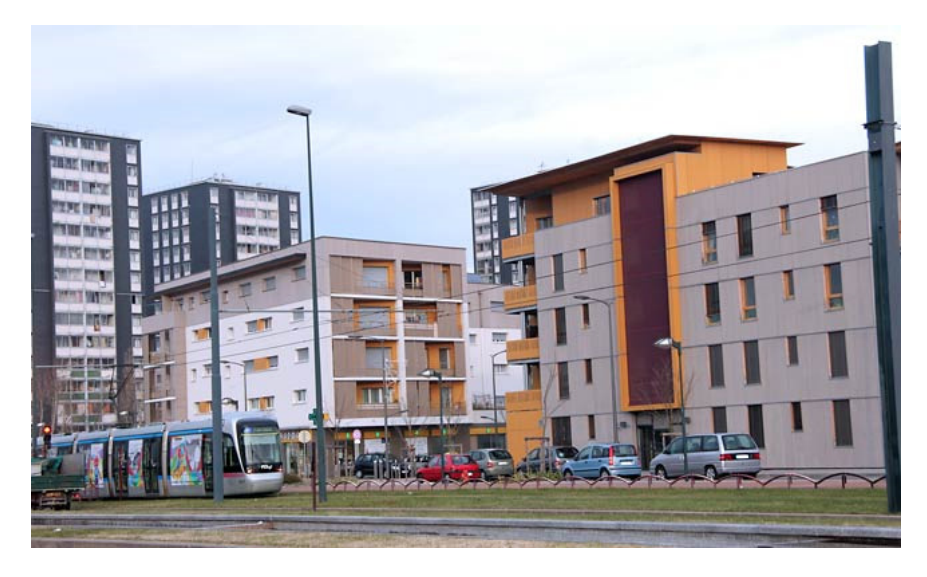
Figure 4: Village 2 Echirolles – after urban renewal.