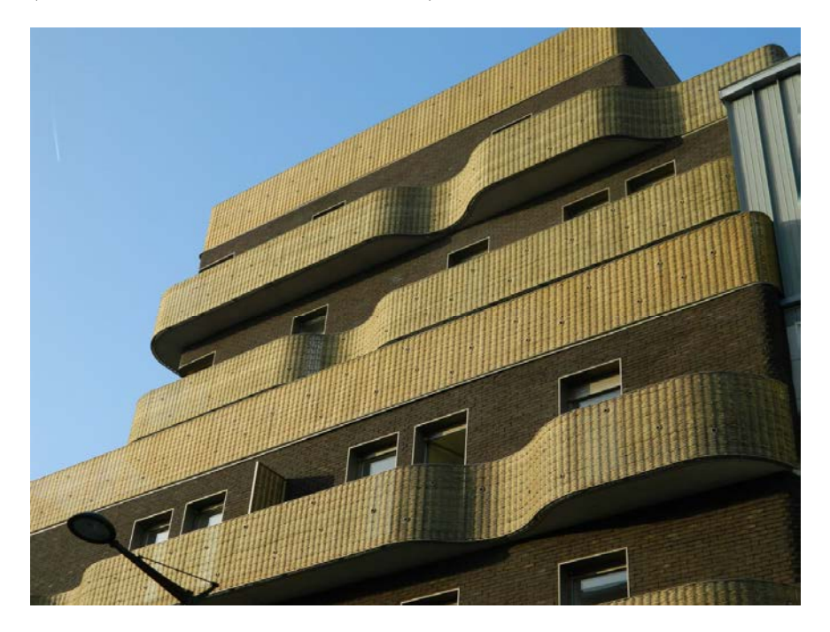
Figure 2: Le Candide, Vitry sur Seine, France (architect: B. Rollet).

Diversifying housing, as it is recommended, is about diversifying housing statuses and architecture. On this latter point, important issues in renewal plans include varied and increasing urban forms (association of buildings with varied heights and volumes), diverse frontages (use of various materials, asymmetrical facades with more or fewer balconies and terraces), and multiple housing sizes (communal, semi-communal or individual).