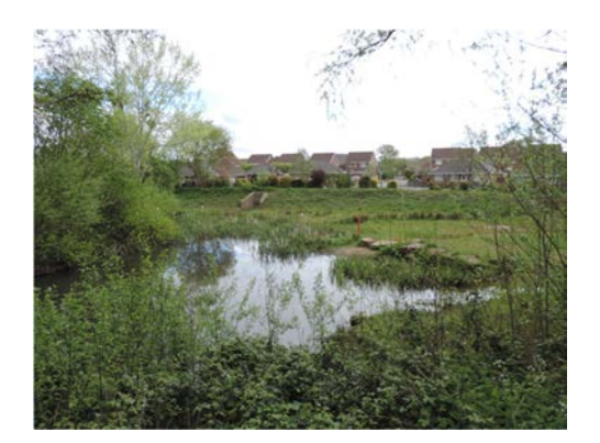
Figure 3: Emersons Green pond 1 site visit, May 2017.