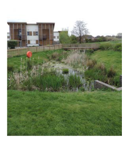
Figure 5: Hanham Hall pond site visit, May 2017.

A surface water drainage strategy was developed incorporating permeable paving, soakaways, a central swale linked to the existing pond (treated to improve its capacity) and improving drainage on a local ditch system (see Figs 5 and 6).