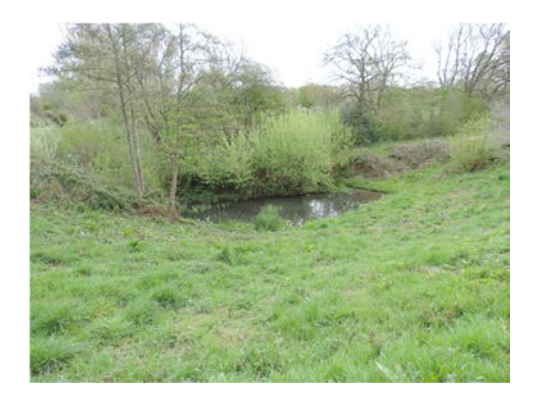
Figure 4: Emersons Green pond 2 site visit, May 2017.

However, there was no more active conversation with park-users to negotiate what was happening, and this caused some dissatisfaction with SGC's actions. As one concerned resident commented: "The workmen went through with brush cutters and took down some substantial trees – many people were very upset by the work being done". They noted that some people quite liked making the area more open, but others felt aggrieved at the "wholesale destruction" of natural areas. In response, a Friends group was established so that SGC would have a body of local residents to communicate with and consult, rather than them feeling "passive recipients of whatever decrees had been made".