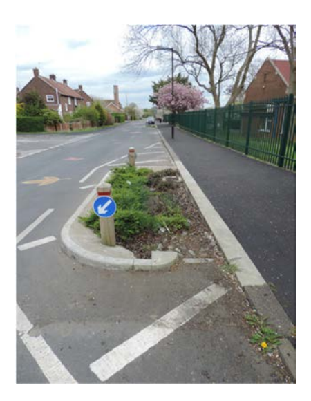
Figure 2: Embleton Road site-visit, May 2017.