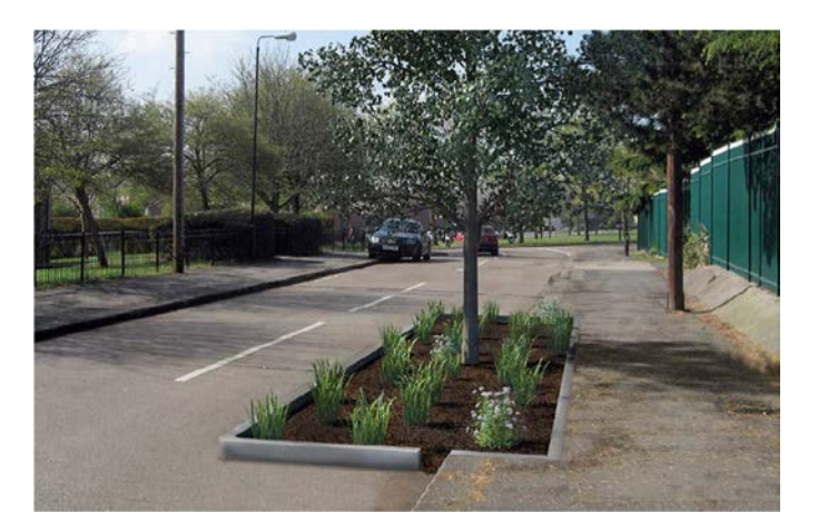
Figure 1: Embleton Road, idealised vision.