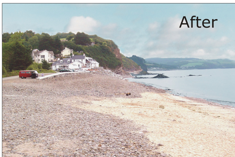
Figure 1: 'Before' and 'after' images of Wiseman's Bridge which respondents were asked to score for scenic quality.

In the second scenario respondents were asked whether they would be willing to pay to fund the replacement of the new defences with an alternative scheme. Four options were described, supplemented by diagrams: revert to natural shoreline, removal of defences with beach replenishment, removal of defences with managed realignment and 'don't know/unsure'. No guidance on costs or on effectiveness of these alternatives was given as the aim was to consider aesthetic and beach use valuation only.