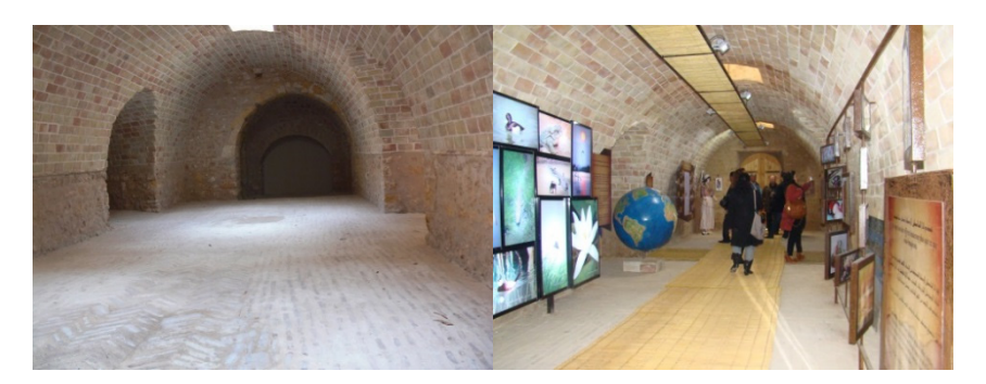
Figure 2: Tunisian Wetlands Room before and after the adaptation to modern use.

The interpretation centre is located in the opposite tower to the main entrance. The total available area for the exhibition is 227 m², divided into 2 main rooms of 100 m² each ('Tunisian Wetlands Room' and 'Ghar El Melh Room') plus a small space of 27 m² that hosts the visitor information point (fig. 2). These two large rooms house 14 exhibition stations that present the wetlands in Tunisia, including the related social and economic activities. There is also a 'Hall of Pirates', which traces the history of piracy in the region. A very easy sequential touring pattern has been established to avoid crowding and a minimal number of groups encountered (fig. 3).