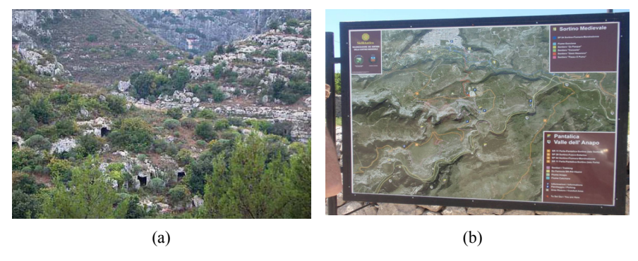
Figure 2: (a) Rock-cut chamber tombs excavated on the cliffs of Calcinara River; (b) Illustrative panel of secondary roads and footpaths of the Natural Reserve.