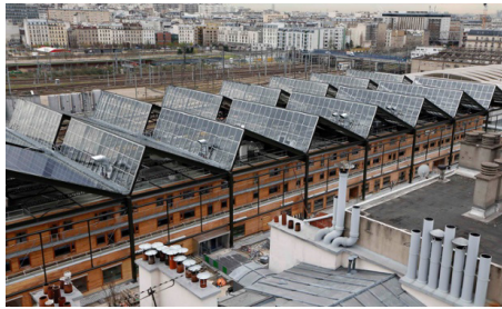
Figure 2: Halle Pajol, Paris. Jourda architects. Photovoltaic panels on the roof structure.

It is possible in some cases to use alternative sources of energy, such as photovoltaic panels, solar collectors, and geothermal energy, in order to make the readapted complex more self-sufficient in respect to energy supply. In the case of industrial buildings, the placement of such systems must be thoughtfully considered in order to not destroy the historical heritage values of the architecture. While this may be difficult at times, it is not impossible. These systems can be placed, for example, on the roof (fig. 2), within new structures in public space, or on newly built objects within the complex.