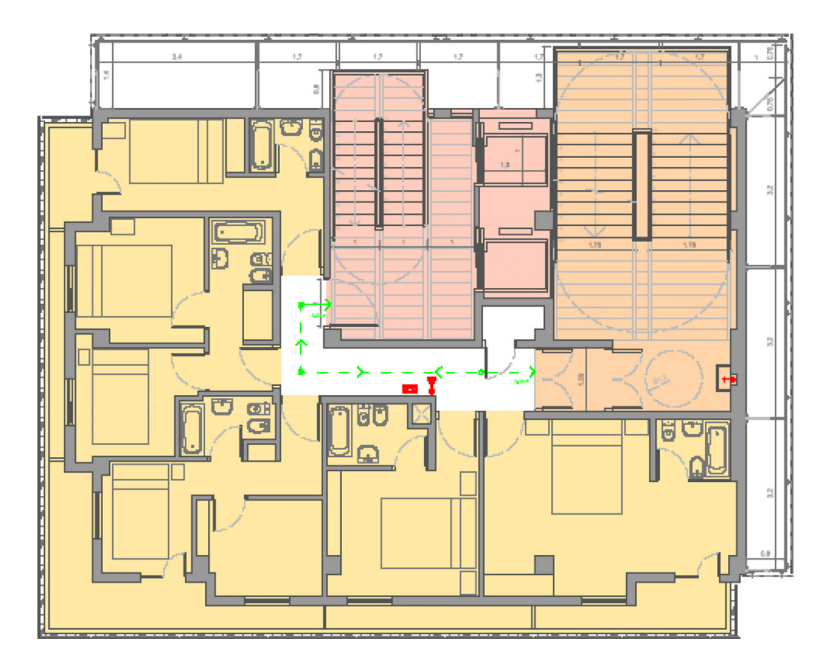
Figure 3: GS-2 modified floor with two new fire escapes.