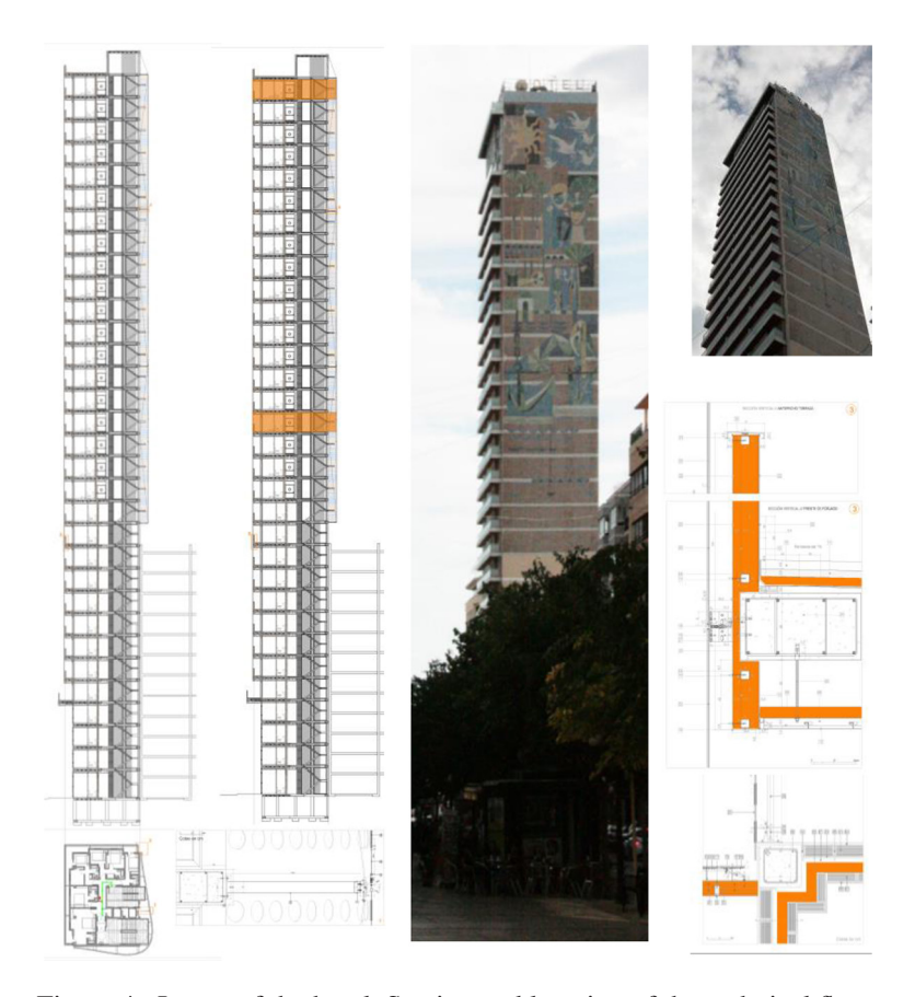
Figure 4: Image of the hotel. Section and location of the technical floor.