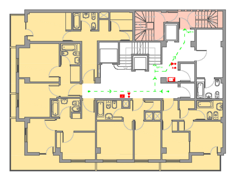
Figure 1: Typical view of hotel. Current state.