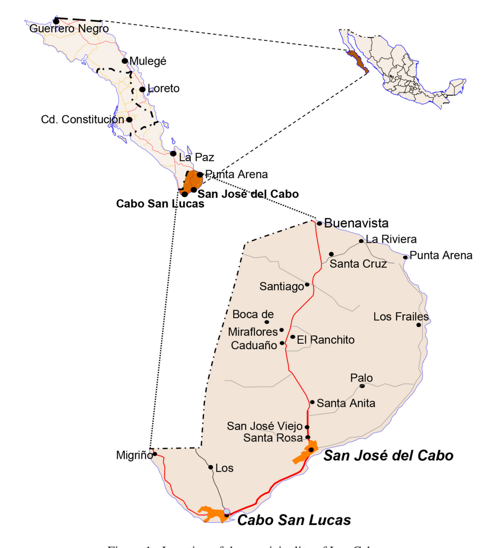
Figure 1: Location of the municipality of Los Cabos.