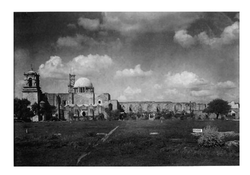
Figure 2: Restoration of Mission San Jose, showing dome under construction in 1936 [15, p. 139].

The City's 'Missions Historic District,' located along the San Antonio River in the south section of the city, includes the lower four missions (Listed from north to south: Concepcion, San Jose, San Juan Capistrano and Espada), their acequias and fields. The area originally attracted both prehistoric Indian and historic Spanish and Anglo populations because of the prevalence of unique natural resources. The abundant water, game and other natural foods seem to have provided prehistoric Indians with an ample non-agricultural subsistence type of lifestyle based upon hunting, gathering and fishing. The area was utilized for agricultural purposes as well as local industries after the establishment of the Spanish Missions [14].