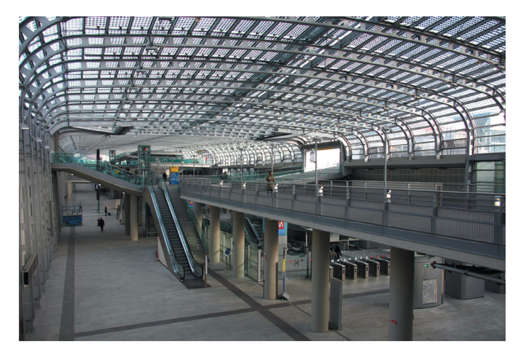
Figure 6: Torino Porta Susa, the connection between the ground floor and the entrance to the subway.

The Porta Susa station is also characterized by the sustainability of the technological and plant engineering solutions used. Thanks to the solar panels integrated in the glass arcade, which are able to generate 680,000 KWh/year while at the same time giving shade to the inside of the building, the station was awarded the European Solar Prize 2012. Air conditioning is naturally sourced, taking advantage of the thermal gradient generated by the difference between the warm air of the arcade and the cooler air that comes from the floor below, where the tracks are. The hot air is expelled through special openings in the upper surface of the arcade. Moreover, a system of radiant panels helps modulate the heating and air conditioning of the interiors as required.