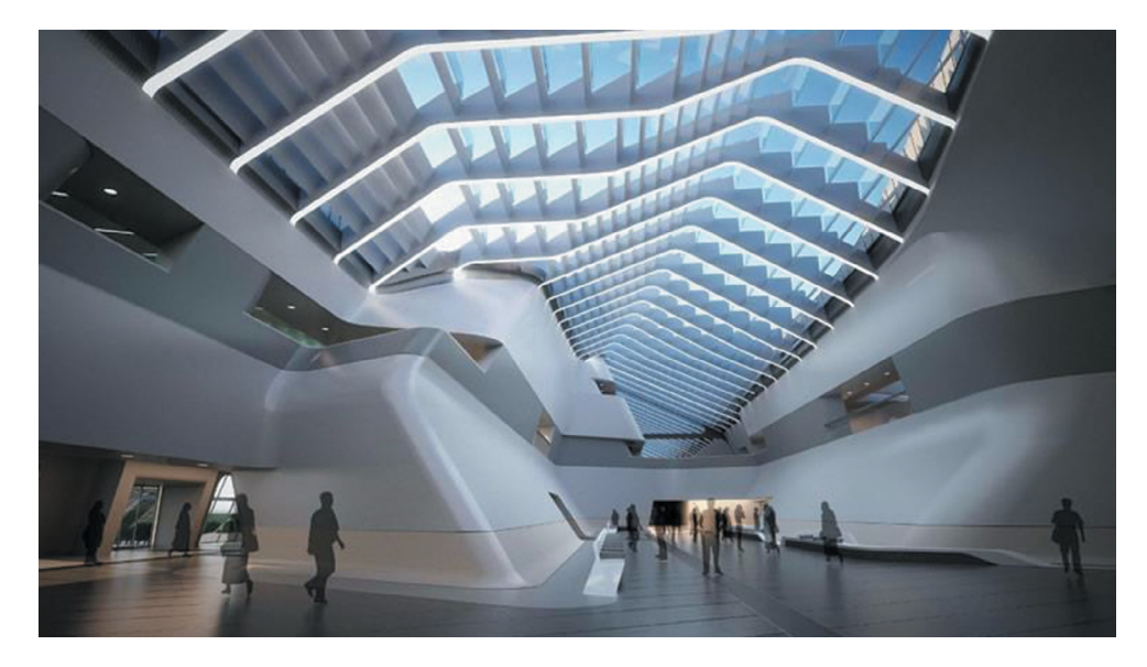
Figure 9: Napoli Afragola, the new high speed station. (Zaha Hadid Architects)