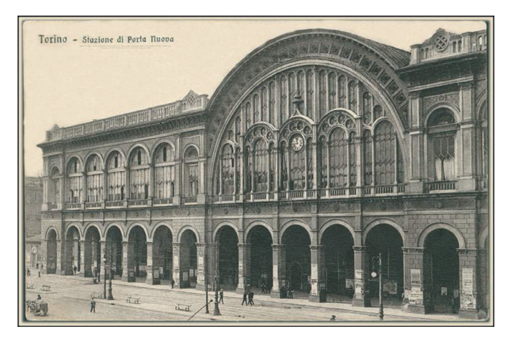
Figure 1: Torino Porta Nuova, the main façade designed by architect Carlo Ceppi. (www.lineetramtorino.com/CartolineB.html)

ticket area decorated with columns, stuccos and frescoes and three waiting rooms, one for each of the three railway classes. The main facade overlooking piazza Carlo Felice was mainly designed by architect Carlo Ceppi. It has a double order of arches on the top and bottom and a central semi-circular 30-metre window surrounded by a ring-shaped frame which stretches as high as the extrados of the roof.