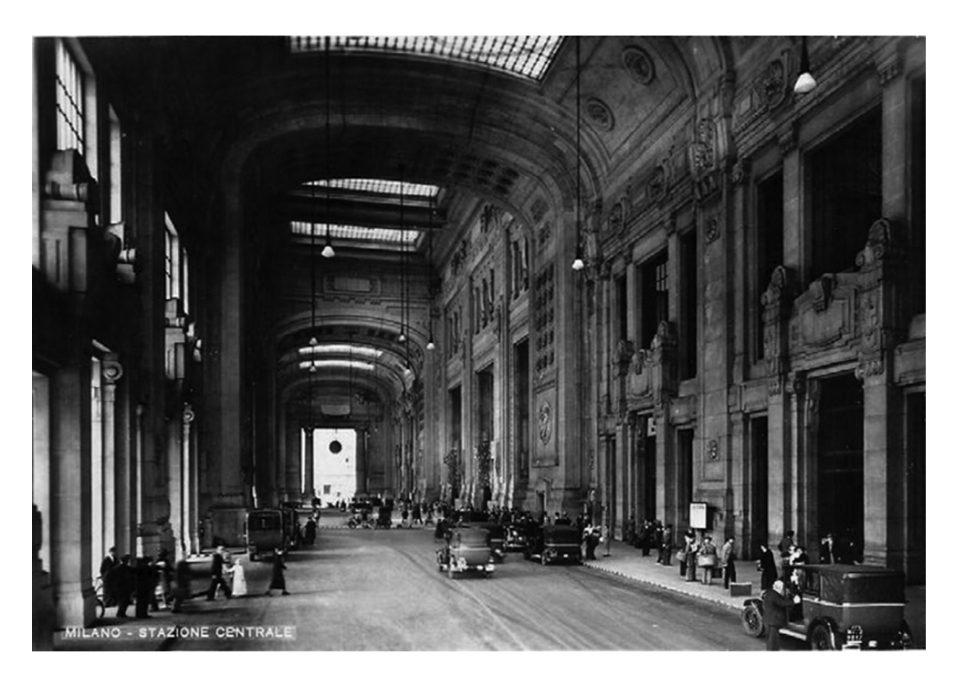
Figure 4: Milano Centrale, the coach gallery.