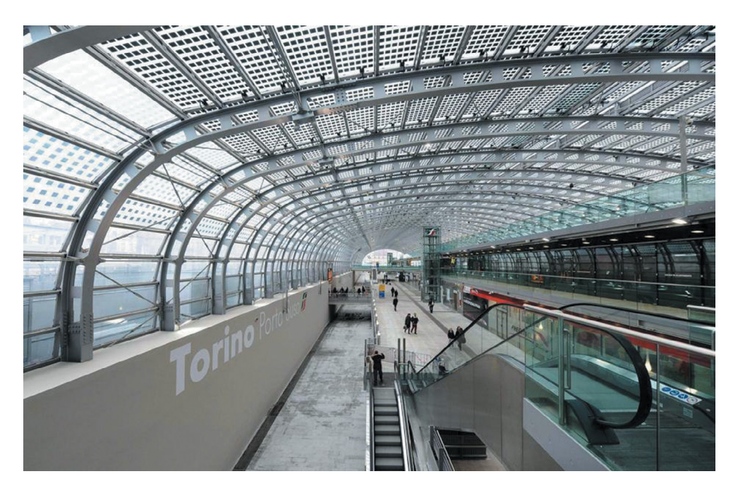
Figure 5: Torino Porta Susa, view of the ground level.

In 2001 tenders were called to create the new passengers' building with funding of 79 million euro. The AREP Group (Jean-Marie Duthilleul and Etienne Tricaud) in collaboration with Silvio D'Ascia and Agostino Magnaghi won the bid out of 55 proposals made. The initial project only involved a partial burial of the railway track between Porta Susa and the Torino Lingotto station. Its subsequent integration into an important operation of urban