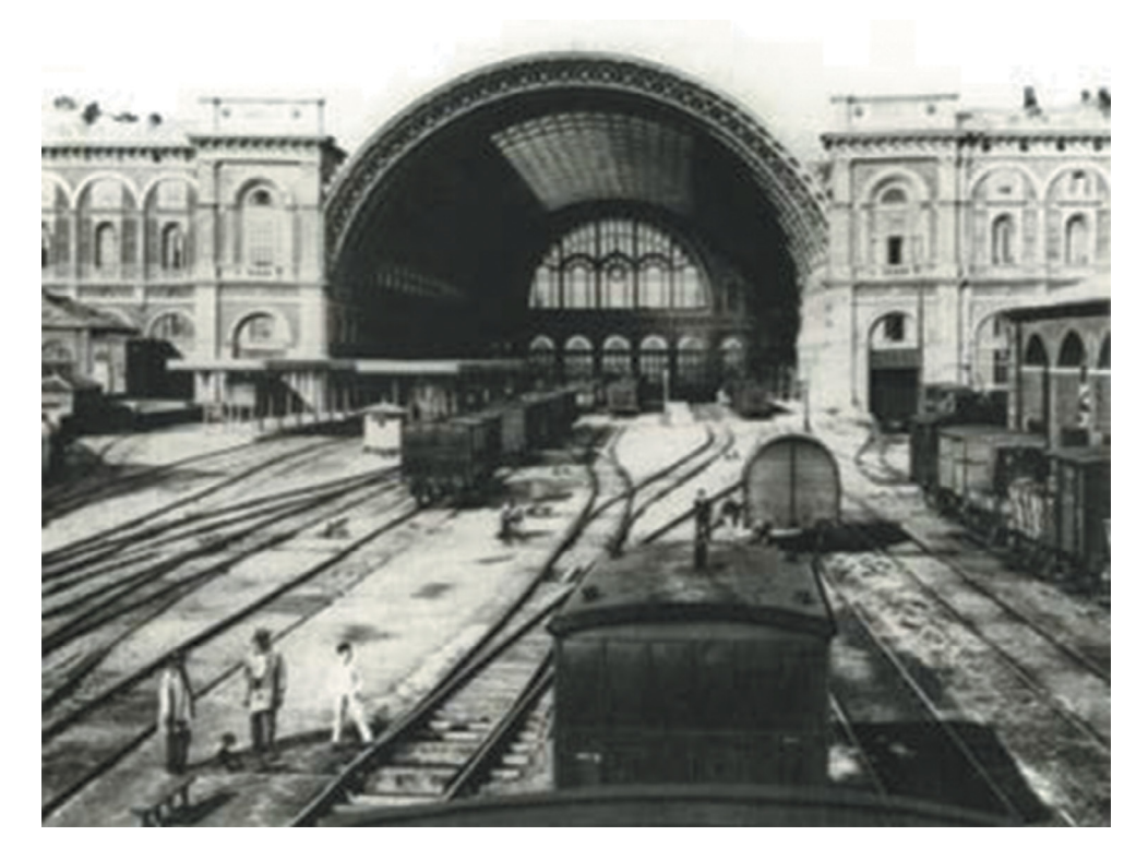
Figure 2: Torino Porta Nuova, the passengers' building and the iron arches of the roof. (L. Ballatore, Storia delle ferrovie in Piemonte, Il Punto: Torino, p. 151, 1996)

and then again in 1912. Works only started in 1925 and the new Central Station was opened officially in 1931 [4] (Fig. 3).