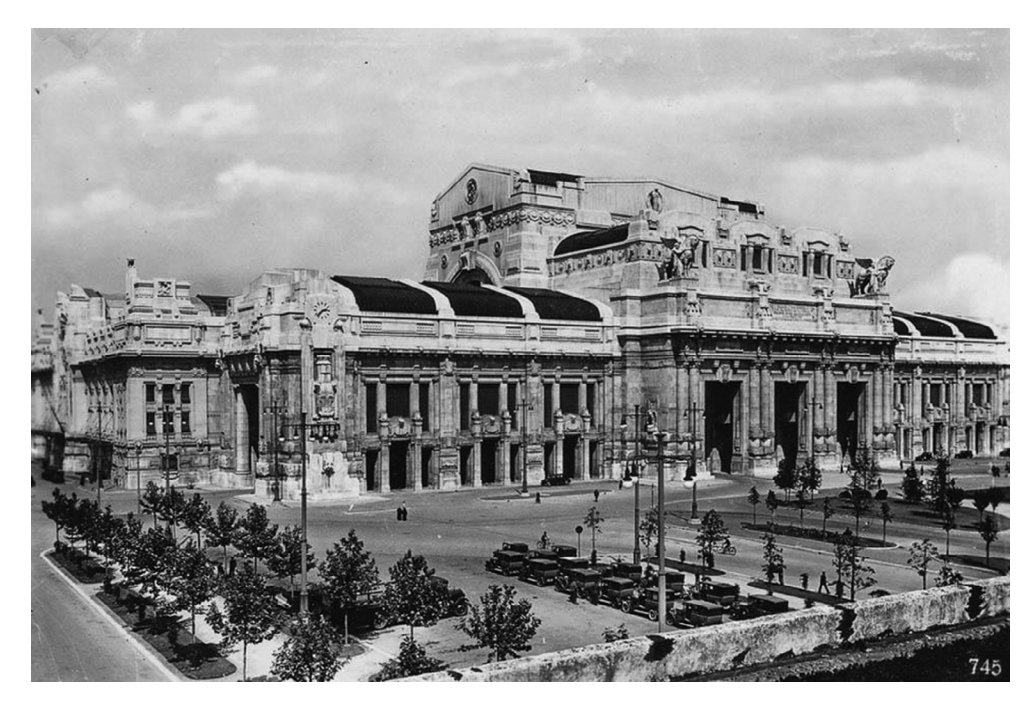
Figure 3: Milano Centrale, the monumental passengers' building designed by Ulisse Stacchini. ( mi4345.it/stazione-di-milano-centrale/ )