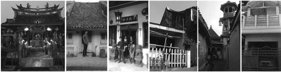
Figure 3: (left to right) Boen Tek Bio temple, an original Chinese house, Benteng Heritage Museum, a 'hybrid' house, Masjid Jami Kali Pasir, a 'contemporary' two-storey house.

has provided information about Cine Benteng for the visitors and given them a hint of old Chinese settlement's nuance.