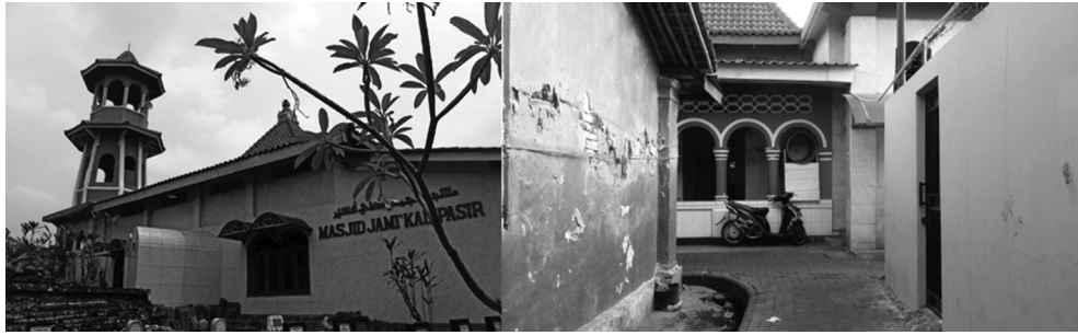
Figure 1: Masjid Jami Kali Pasir (left) and access to the Masjid (right).

evidences about the mosque's history were questionable. He even said that he did not have any written proof about it, except a note on a piece of paper.