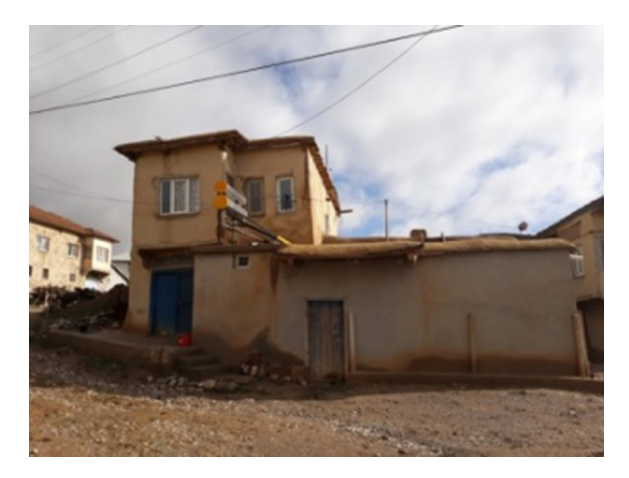
Figure 8: A house with an animal shelter.