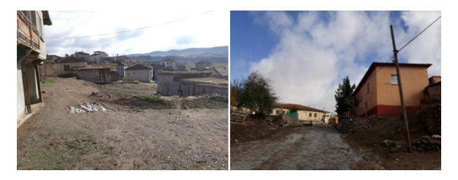
Figure 7: An earthen and a cobblestone ways.