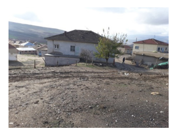
Figure 5: A view from Karaca Village.

<u>Year / Population:</u> 2017 / 229 (Male:110, Female:119)