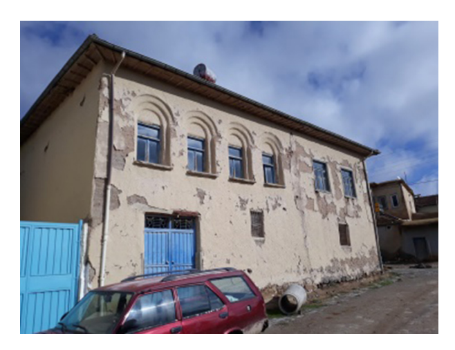
Figure 10: An example of window with 'kantamar'.