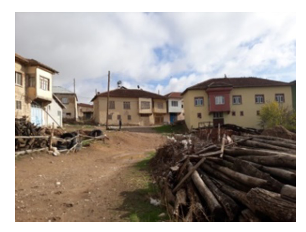
Figure 9: Buildings entered from the street.