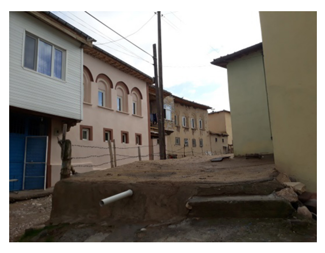
Figure 11: An example of window with 'kantamar'.