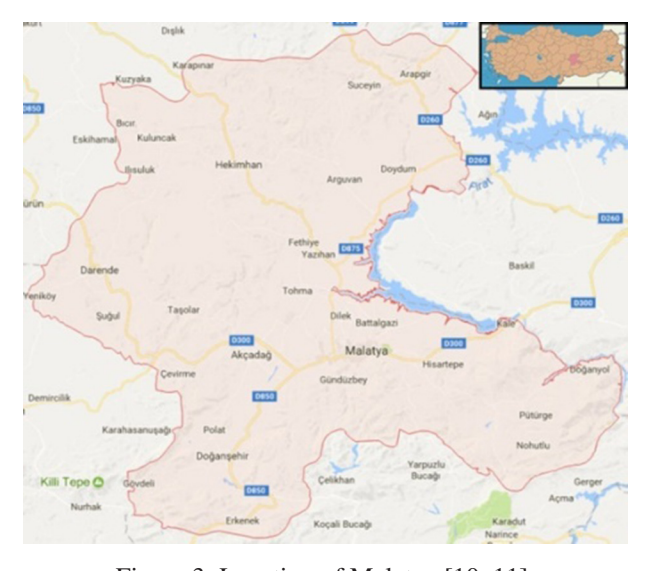
Figure 3: Location of Malatya [10, 11].

One of the village settlements in Malatya, which stands out with its local characteristics in terms of its architectural characteristics, is the Karaca village (Figs. 4 and 5). Karaca village, which is a settlement of Yazihan district, has the following general characteristics: