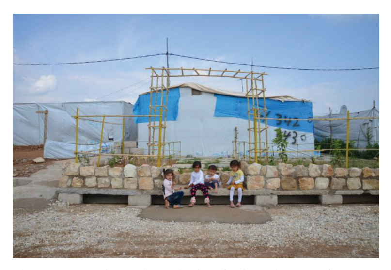
Figure 2: Decorative and productive food garden, Domiz Camp.

metre by five metres (Fig. 3, left). In this space, the family has used recycled guttering to create a vertical garden to grow onions and garlic. On the floor it grows salad and herb crops, while the front section, decorated by recycled wooden crates, has decorative flowers, shaded on the roof by more flowers and vegetables. Figure 3 right shows a concrete walkway edged with container grown plants and trees, which aim to provide decoration and some privacy which is hard to achieve in the camp due to the lightweight nature of the buildings. Also, evident here is the juxtaposition of a wall made from UNHCR branded tarpaulin that creates a curtain with a wall of the neighbouring house, which is built to a higher standard of development.