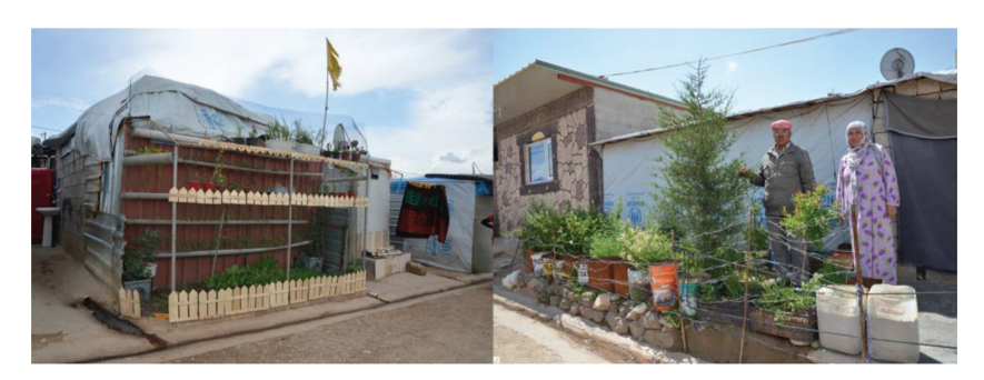
Figure 3: Left, one metre by five metres garden. Right, concrete container garden.

Food gardening was widely evident but not dominant in camps. Food production ranged from one family that was growing a single garlic crop for cash in a limited space, to micro-allotment gardens of multiple vegetables, or leafy vegetates interspersed with ornamentals. While displaced people suffer from endemic poverty, refugees in particular, who may not be able to work or have bank accounts, food, both fresh and processed, is widely available yet restricted by cost and uneven distribution. Food growing therefore, while it might be critical